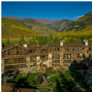
The Manor Vail Lodge is the site for the 2016 Stars in the Mountains.

Save the Date! 2016 Stars in the Mountains: July 15-17 at the Manor Vail Lodge